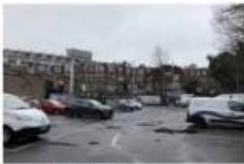
1 Thomas Lane car park (existing)