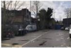
4 Thomas Lane car park (existing)

The site covers the area currently used as Thomas' Lane car park, to the rear of Catford Broadway accessed from Thomas' Lane and incorporates the Thomas' Lane depot, currently occupied under a mearwhile-use arrangement by Suparsels.