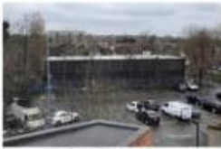
3 Thomas Lane car park (existing)