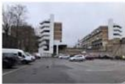
2 Thomas Lane car park (existing)