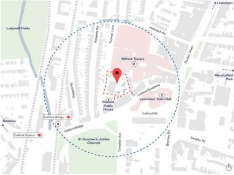
Site location plan