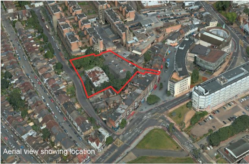
Aerial view showing location