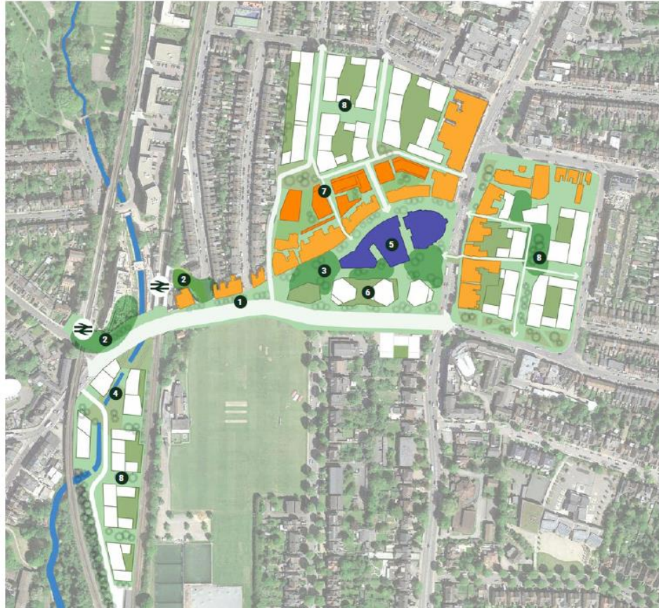
The Catford key placemaking principles in summary

4 Creating a more natural setting for the River Ravensbourne including unveiling the culverted river